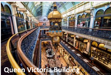
Queen Victoria Building