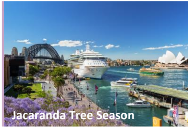
Jacaranda Tree Season