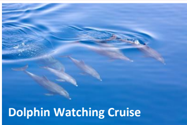
Dolphin Watching Cruise