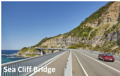
Sea Cliff Bridge